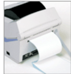
» Rear Side Paper Loading