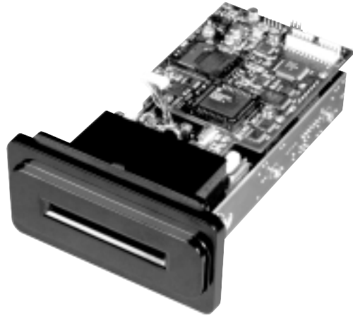
Shown with D Bezel